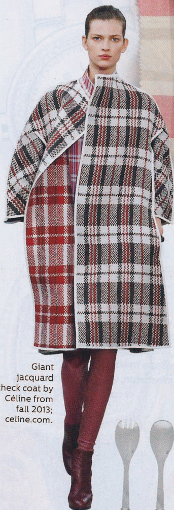
Giant jacquard check coat by Céline from fall 2013; celine.com.