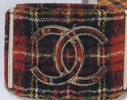
Precious tartan cuff by Chanel; 800-550-0005.