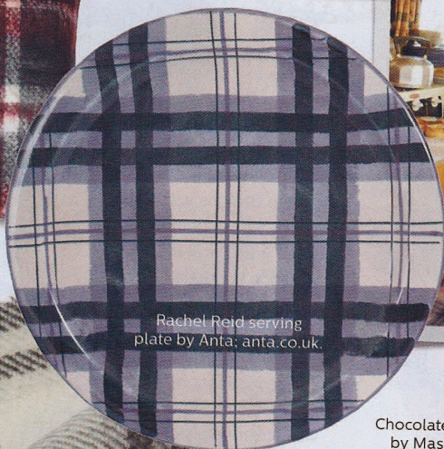
Rachel Reid serving plate by Anta; anta.co.uk.