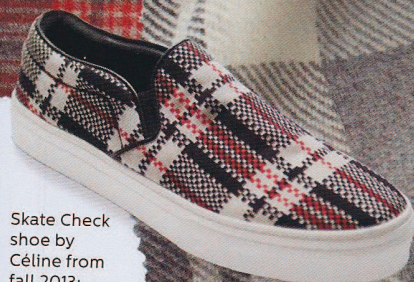
Skate Check shoe by Céline from fall 2013; celine.com.