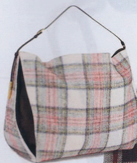
Beckett shoulder bag by Stella McCartney; stella.mccartney.com.