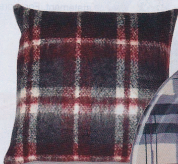
Sir Rouge pillow by Jean Paul Gaultier for Roche Bobois; roche-bobois.com.