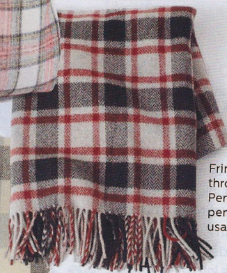
Fringed wool throw by Pendleton; pendleton-usa.com.